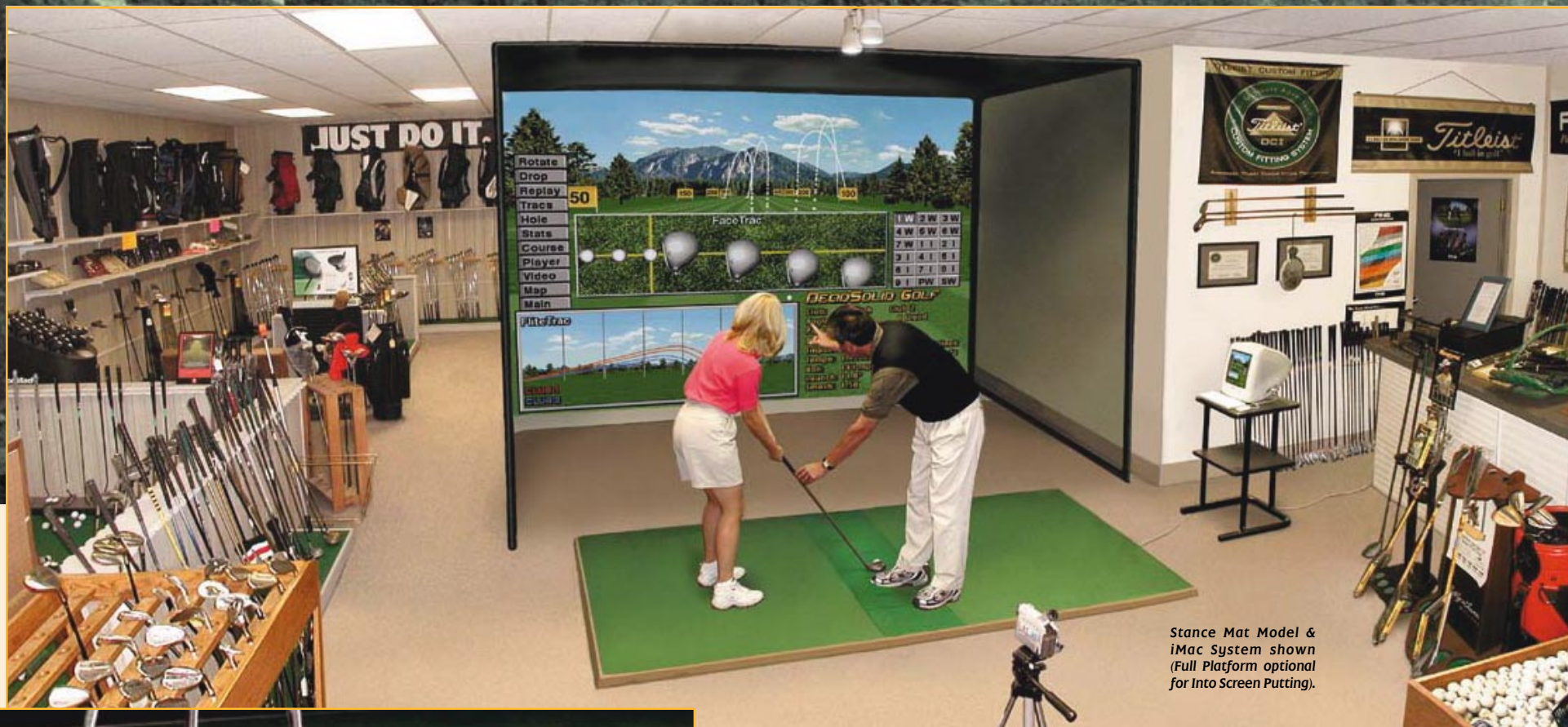
Stance Mat Model & iMac System shown (Full Platform optional for Into Screen Putting).